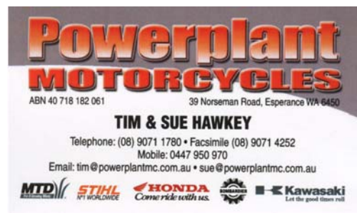
Tim & Sue new owners Powerplant