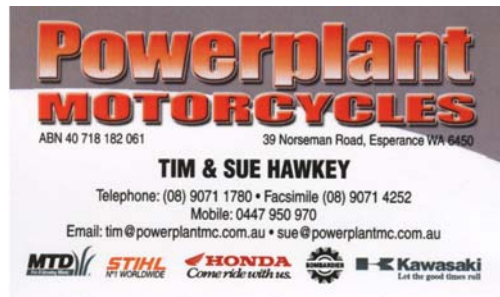
Tim & Sue new owners Powerplant