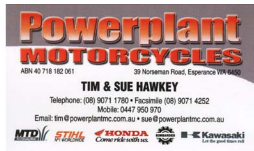
Tim & Sue Hawkey at Power Plant