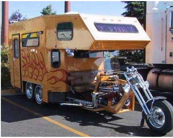
The ultimate GoldWing??