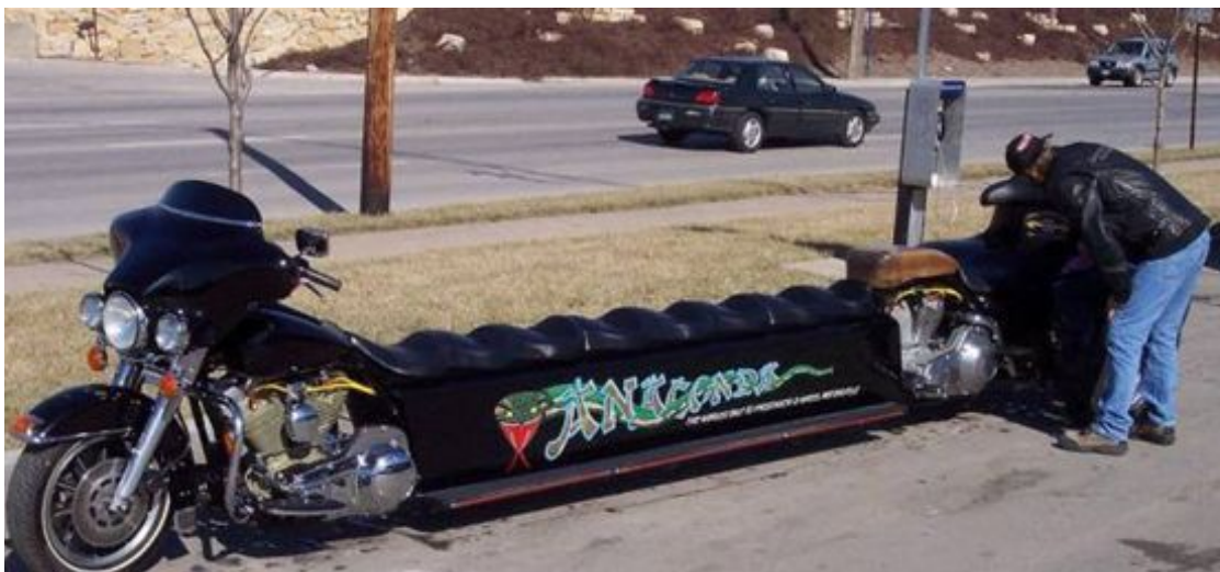
Ooooooh yeah, looks good, comfortable, practical, seats 9, two V Twin engines; sounds awesome.....