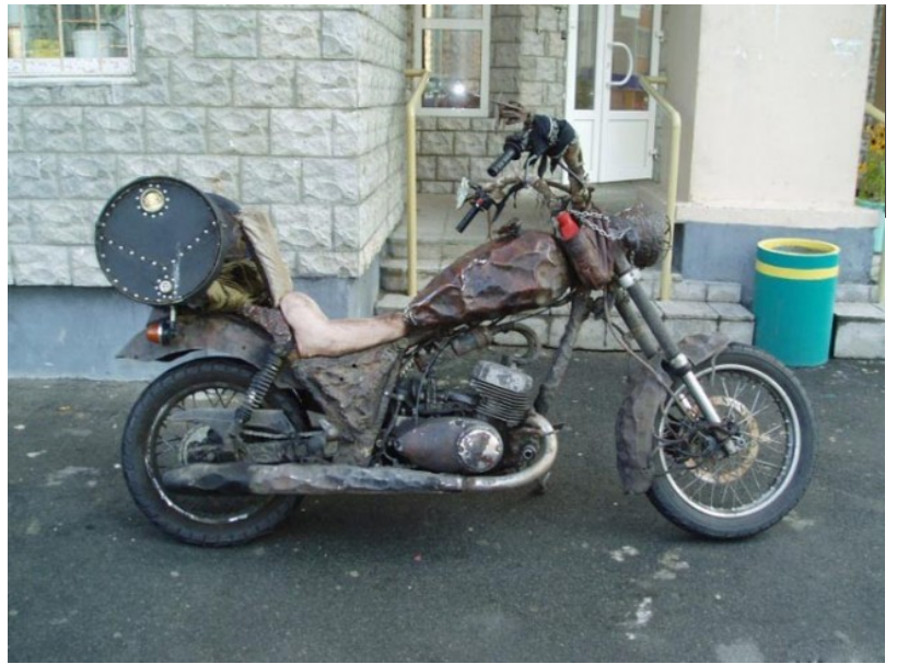
Yep, it's definitely JAPANESE